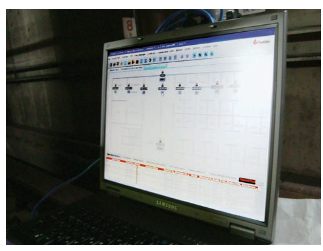
Linear typology shown on Firetide HotView Pro NMS

Phone: +1 408-399-7771 Fax: +1 408-399-7756 Email: sales@firetide.com