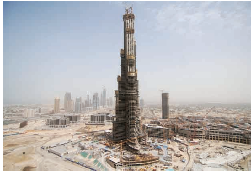
Constructing the world's tallest skyscraper.

Samsung construction workers now use a walkie-talkie system to communicate over the wireless mesh. In addition, the same Firetide mesh network supports Sony IP video cameras deployed at the construction site for monitoring and loss prevention, as well as Samsung Wi-Fi® smart phones. “Initially, we expected the Firetide