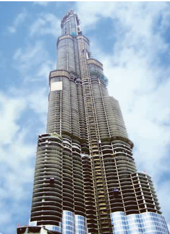
Reaching new heights.