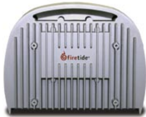
Firetide HotPort outdoor mesh node