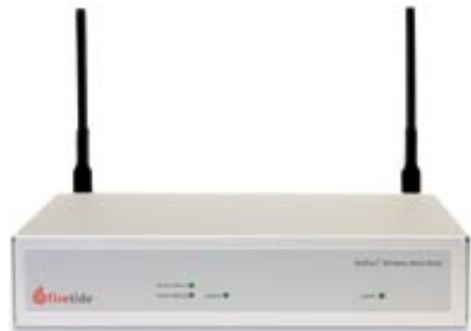
Firetide HotPort indoor mesh node

Firetide HotPoint® access points can optionally be deployed indoors or outdoors to provide first responders and other public safety officials with commercial Wi-Fi communications. Because the mesh is a multipoint-to-multipoint network, and not point-to-point, FCC restrictions on permanent installations do not apply. This same characteristic also allows a HotPort mesh to overcome the many line-of-sight obstructions that cause problems with other wireless technologies.