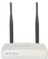
HotClient 2000 Outdoor CPE

Firetide WLAN Controller offers centralized configuration and management of the wireless LAN. The all-inclusive controller delivers security, policy and mobility for up to 50 access points. Three controller appliances can be stacked to support up to 150 APs. Building on its extensive experience with wireless mesh backhaul, where bandwidth is precious, Firetide designed its access solutions to distribute intelligence to the edge, resulting in superior coverage and user experience with only a minimal amount of bandwidth taken up by critical control traffic to the centralized WLAN Controller.