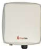
HotClient 2000 Indoor CPE