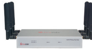
HotPort 7010-900 Indoor Mesh Node