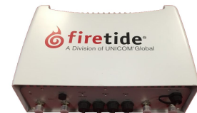
HotPort 7010(W) Weatherized Node