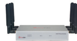
HotPort 7010 Indoor Mesh Node

HotPort 7000 MIMO-based infrastructure mesh delivers best-in-class performance with application user throughput of up to 300 Mbps, exceeding that of wired solutions like T1, Fast Ethernet and OC-3 fiber, providing a viable alternative to fiber or leased lines. It enables delivery of multiple high-speed services over wireless, including high-resolution real-time video surveillance, broadband access, HDTV multiple voice streams over IP and high-speed infrastructure backhaul. Indoor models feature: integrated tools for easier deployments and network management, dual or single configurable radios in 900 MHz, 2.4, 4.9 and 5 GHz frequency ranges.